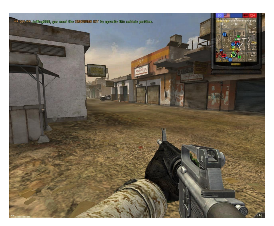
The first person point of view within Battlefield 2.

Within the Tactical Gamer community I immersed myself in a warfare simulation game known as Battlefield 2 (BF2). BF2 is a genre of video game known as a first-person shooter, wherein the individual experiences a virtual world from the first person point of view, which means he does not see himself within the game. The only part of the 'self' that is seen in the game is one's own weapon and hands. The following is a typical ingame screenshot (an image, or 'photograph') of what I might see on my computer screen while playing: