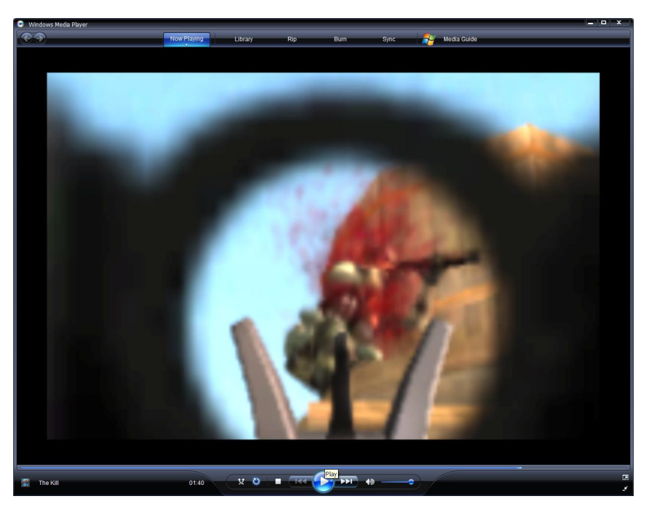
A still image from the video The Art of War .

As an exercise in virtual video ethnography, The Art of War provides an occasion for interrogating the relationship between the real and the virtual. My action within the virtual world of the online video game would normally be described in terms derived from the real world – kill, blood, death. Within the analysis of video games the behaviour I engaged in, using a 'gun' to 'kill' the 'enemy' would also generally be described as aggression. Yet my emotional state at the time was hardly comparable to aggression. Indeed, my response to the 'kill' is captured within the video as one of awe at the drama of the simulation – whereas in life I would have been overwhelmed by the horror of the event.