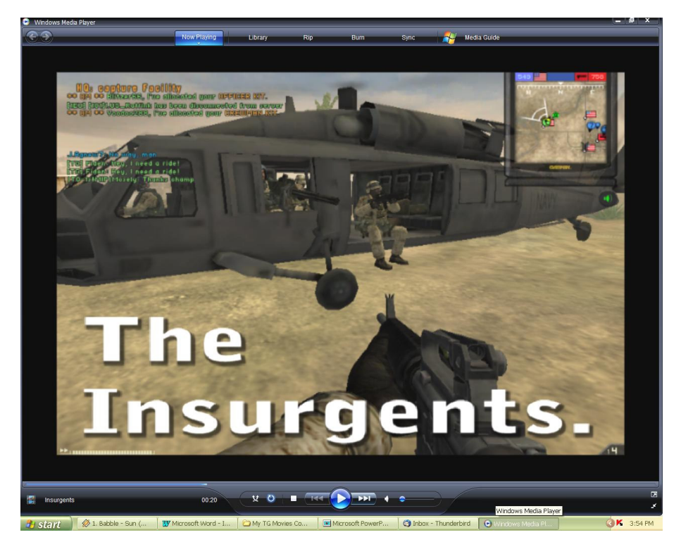
Appropriation and cultural critique within virtual worlds.

The Insurgents is intended to show how gamers do not automatically accept the official definition of the War on Terror or the agenda of imperialism. In the tradition of fan cultural production the video illegally uses copyrighted music and video material. By playing with the notion of a dehumanized enemy The Insurgents seeks to challenge the absolute authority of presidential discourse which claims that we must either stand for or against the military agenda of the United States. 'Illegal' thoughts combine with 'illegal' images to create a moment of subversive cultural production through the use of in-game video footage. Thus the game of war is transformed into a moment of war-resistance.